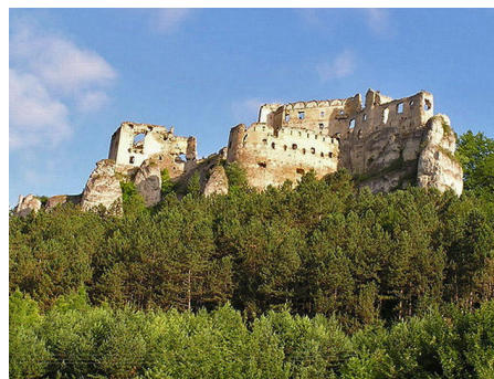
Obr. 2: Lietava castle