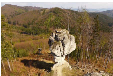
Obr. 1: Zbýňov mace.

4. Kľak summit (1351 m): one of the most popular and nicest peaks of the southern part of Little Fatra Mountains. This trip requires transportation by car to Fačkov saddle (Fačkovské sedlo, 24 km one way) . The climb follows the red marked trail to Staré cesty , switching to the yellow marked trail to Pod skalou and reaching the peak by a green marked trail. Distance from Fačkov saddle is 4.8 km with cumulative elevation 580 m.