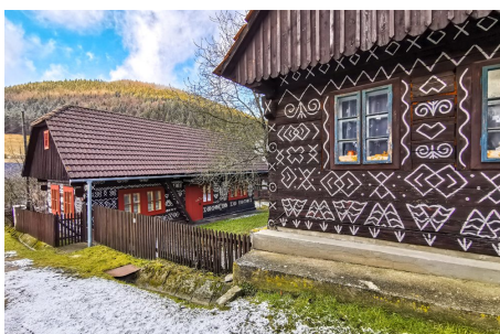
Obr. 3: Čičmany village